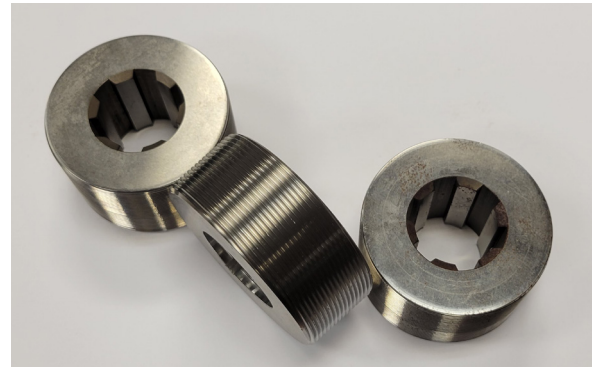
Double Support Die Holders (Splines)